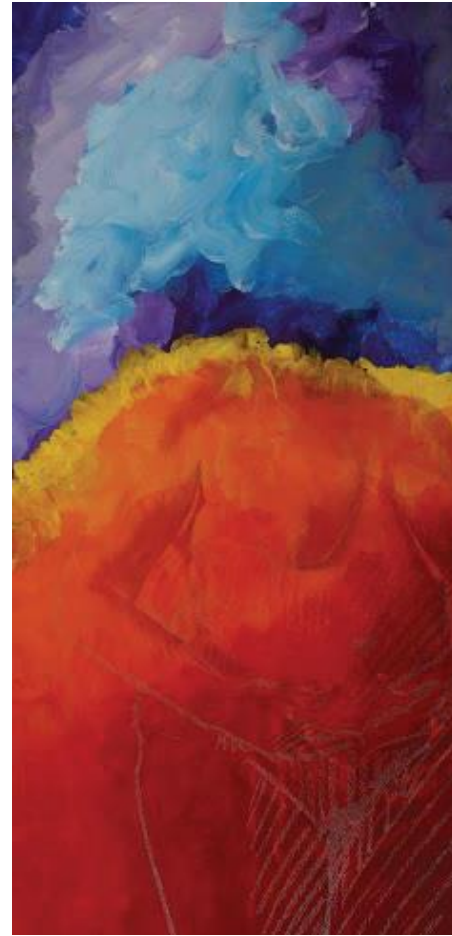
Part 1 : "I and me + Part 2: "Mine" – Bernadette Vincent $ 400 (separately $250) Each artwork are limited prints, only 5 prints of each.