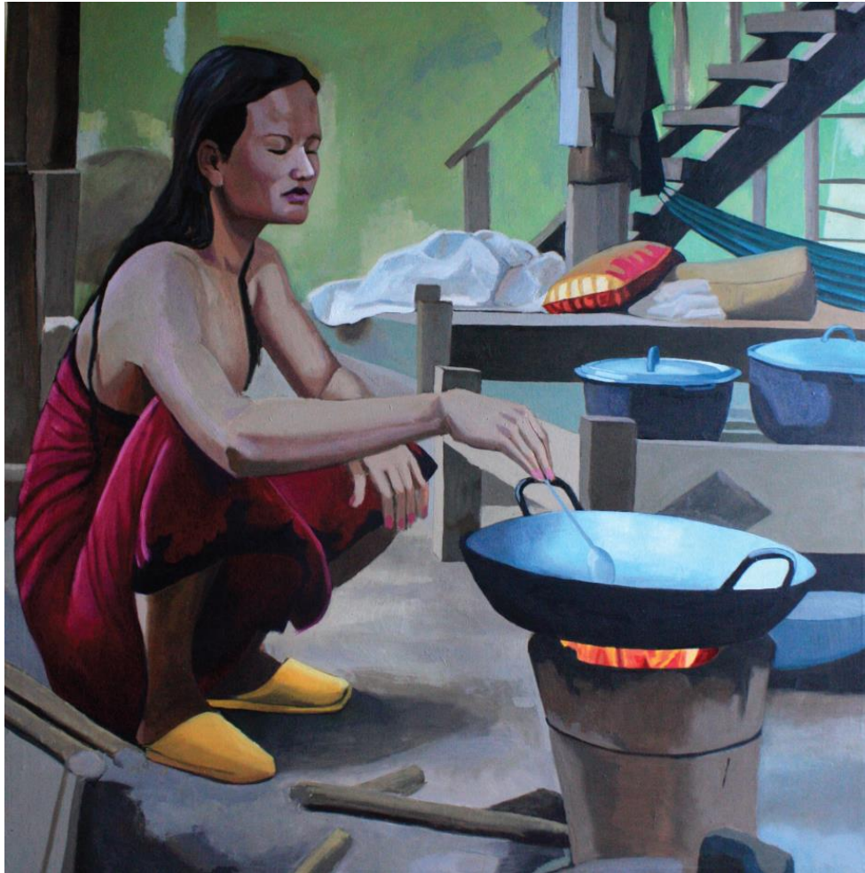
Cuisine - Marcel Wanders