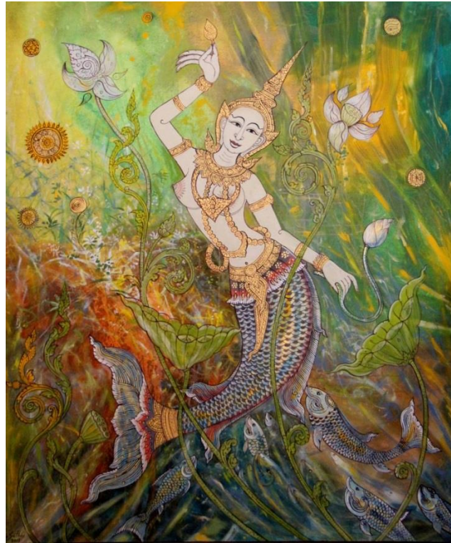
Mother of Nature – Chhim Sothy Mixed media on canvas 128 cm x 152 cm $ 2500