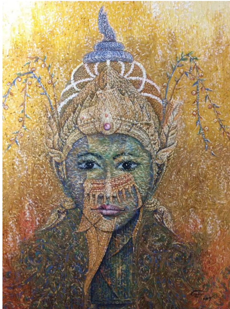
វង់ចាំ - Ouk Chim Vichet