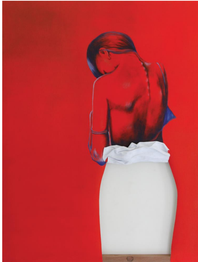
Proh douc meas, srey douc somley / Men Are Gold, Women Are Cloth – Frederikke Tu 75x100 cm $900